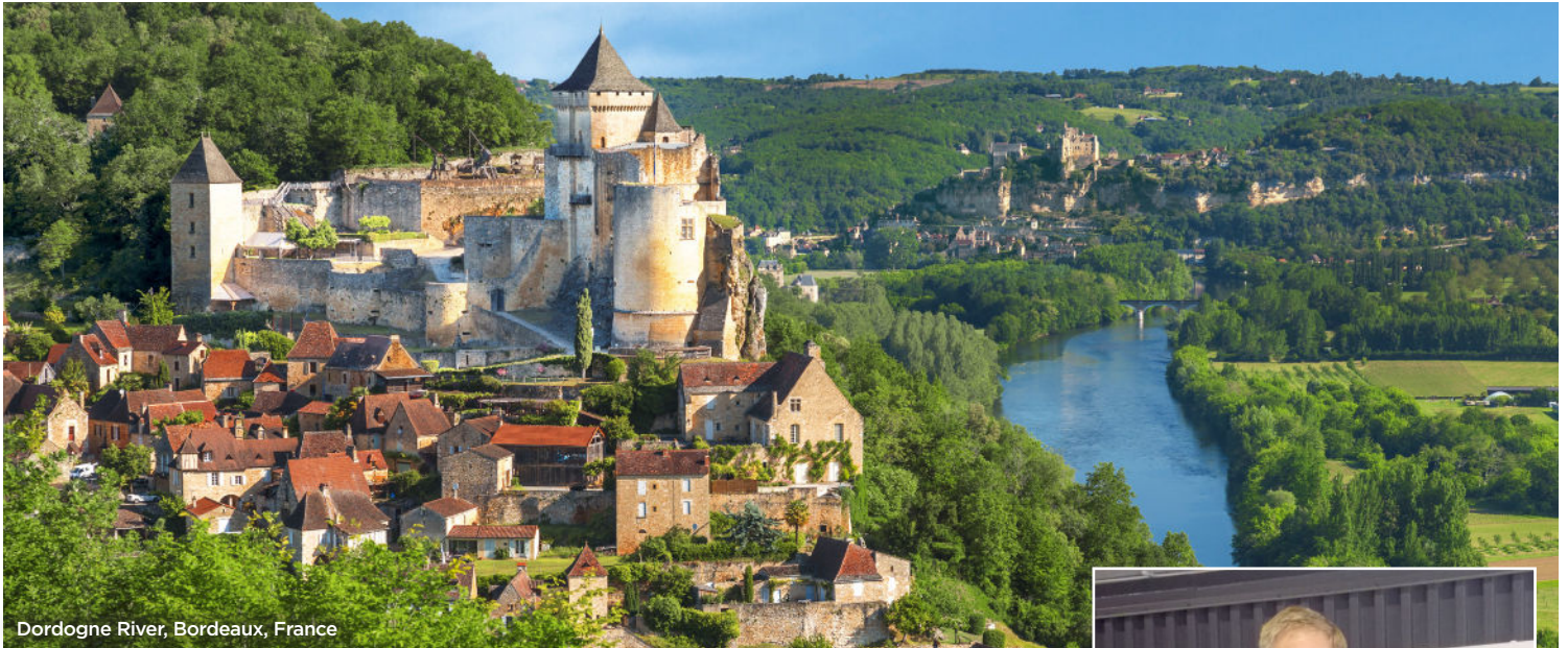
Dordogne River, Bordeaux, France

Uncork local traditions, savor intense flavors and enjoy palate-pleasing adventures during an AmaWaterways Wine Cruise